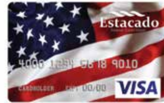
Estacado Traditional Card