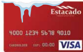
Estacado Platinum Card